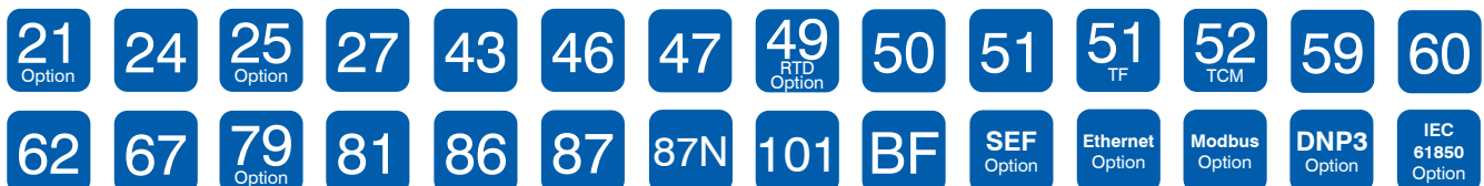
Figure 1 - BE1-11 \epsilon Device Functions