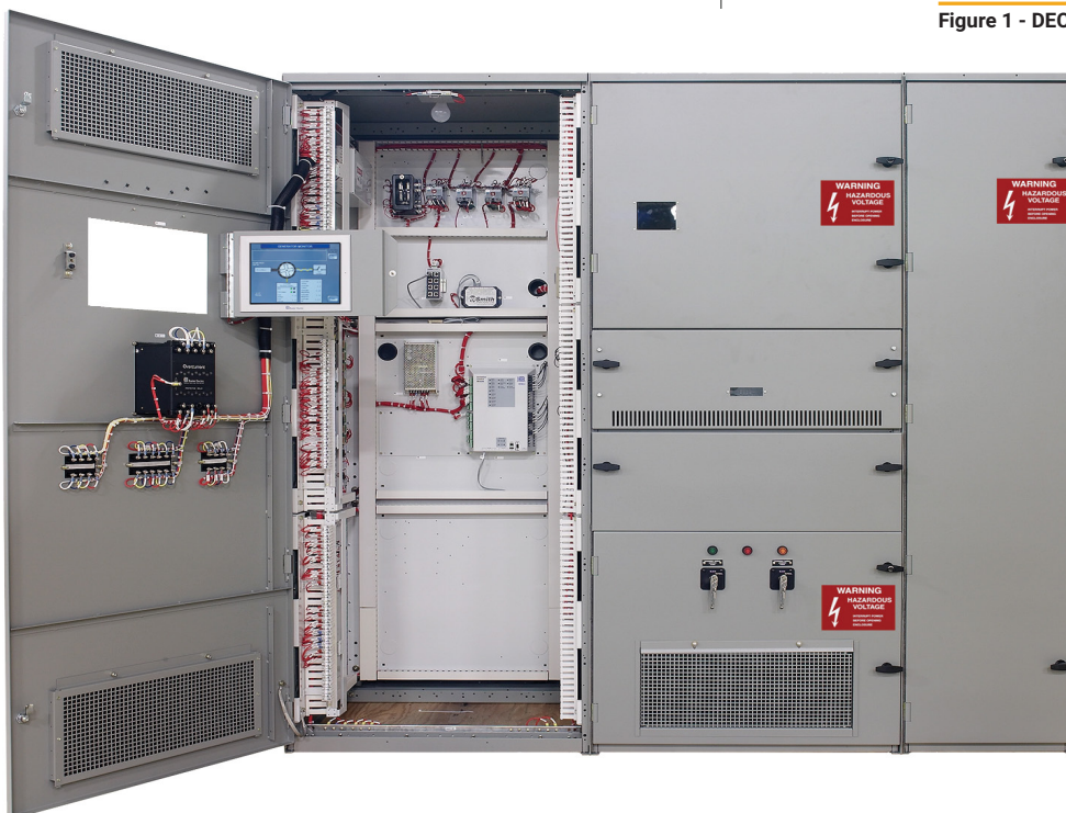
Figure 2 - DECS-2100 cabinet for full system replacements