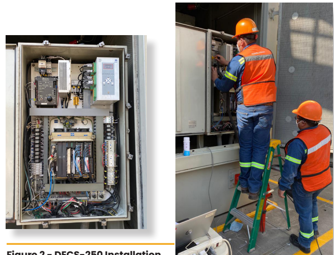
Figure 2 - DECS-250 Installation

The new system has significant additional tools for more effective management of the generation system, including Event Logs, Oscillography Logs, Programmable Alarms, UEL and OEL. These tools make the technician's job much easier and create more stable power delivery for the plant. The client was extremely satisfied with the Basler DECS-250 system and appreciated the ease of the installation and commissioning.